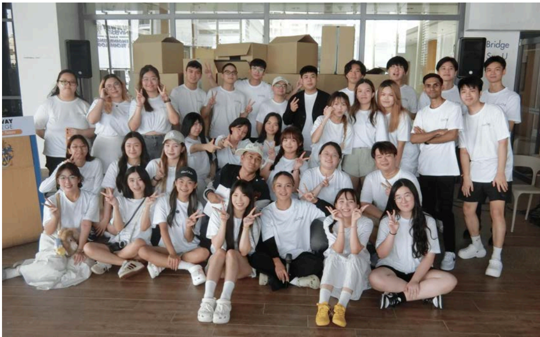
Written by: Ooi Yu Wen