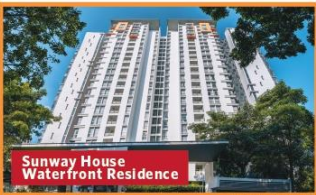
Sunway House Waterfront Residence