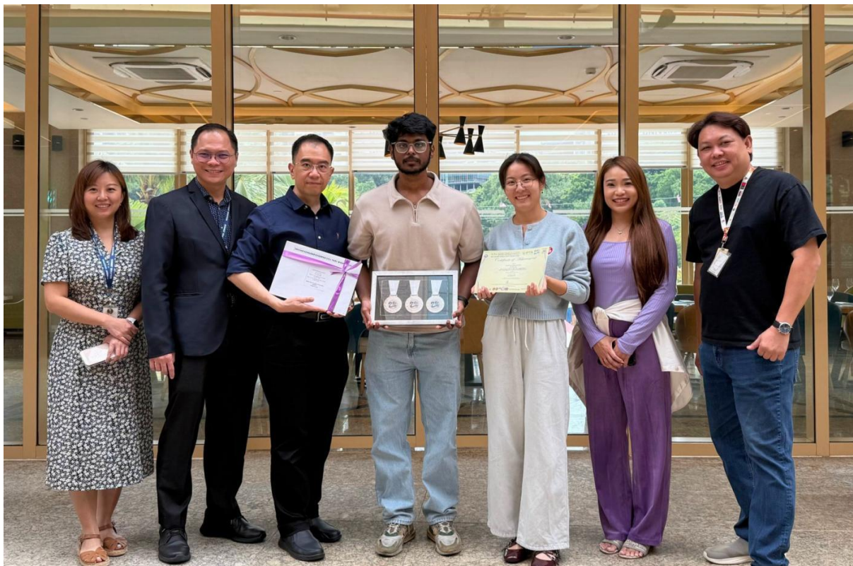
The winning team at the Brunei Crown Prince CIPTA Award 2025

The vision behind Sunway University's Net Zero Carbon Building is already inspiring real-world impact. At the Brunei Crown Prince CIPTA Award 2025, students from the Faculty of Engineering and Technology (FET) clinched the Silver Medal and 1st Special Mention Award in the ASEAN New Invention & Innovation Category.