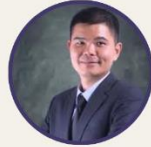
PROF KER PIN JERN WP 2